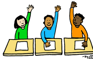
IN THE CLASSROOMS